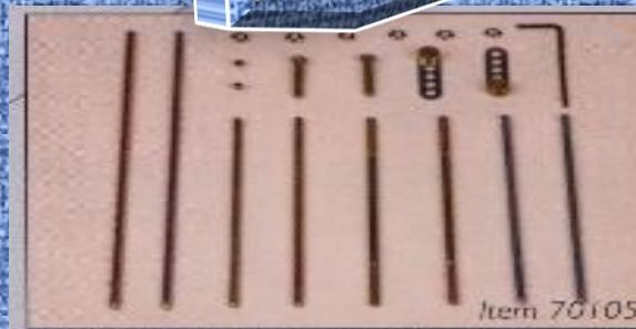
3mm Diameter Shaft Set

The 3mm Diameter Shaft Set includes eight hex shafts of various lengths. Also included in the set are two adjustable crank arms with a hex wrench for tightening the crank arm set screws.