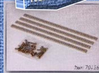
Long Universal Arm Set

Durable ABS resin arms offer a wide array of use in construction, such as linking, shaft coupling, or structuring. 3mm holes are allocated in 5mm intervals. Cut to required length.