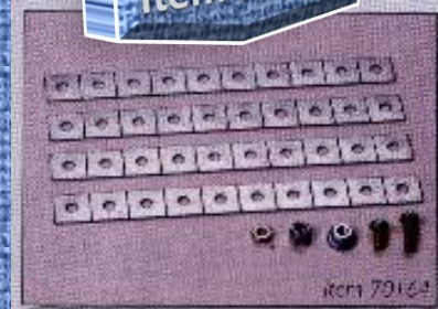
Universal Metal Joint Parts

These metal joints can be used to connect various construction pieces. Combined with the universal arm and universal plate sets, a variety of exciting crafts can be constructed.